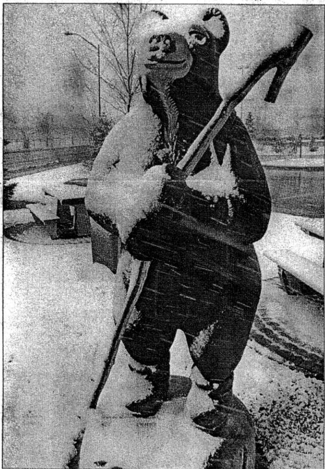
THIS CARVED WOODEN BEAR standing outside the Tourist Information Centre near the International Bridge braves the weather conditions, as winter reared its ugly head Monday.