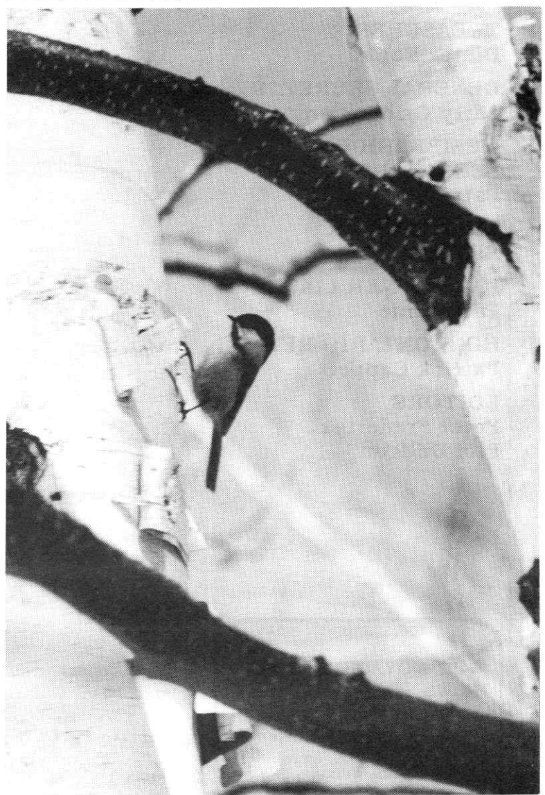
Winter companion on the trail