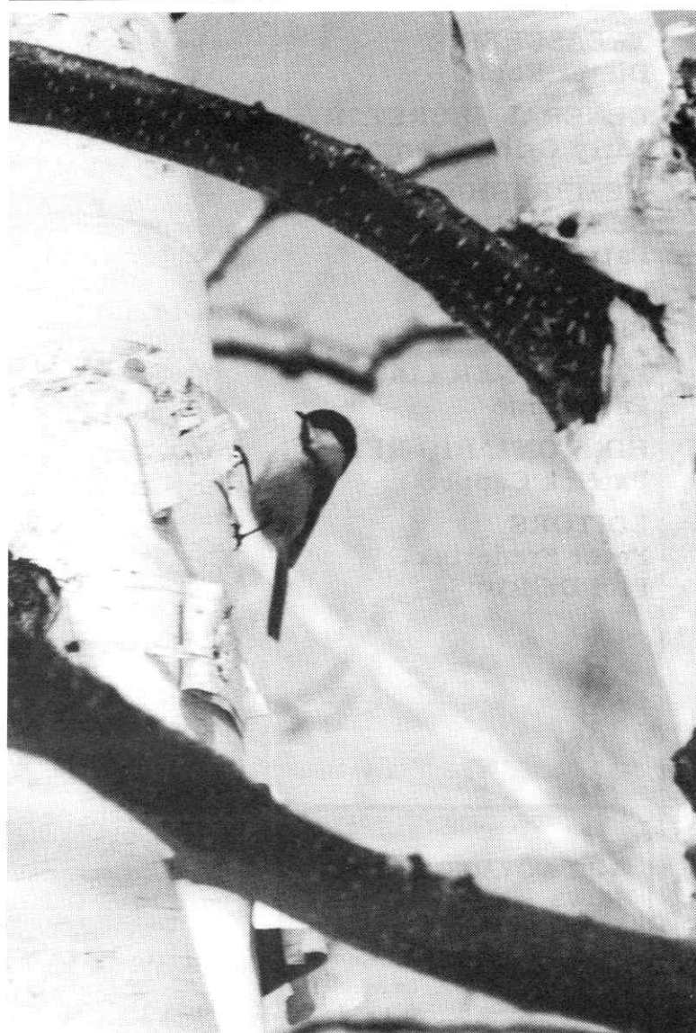
Winter companion on the trail