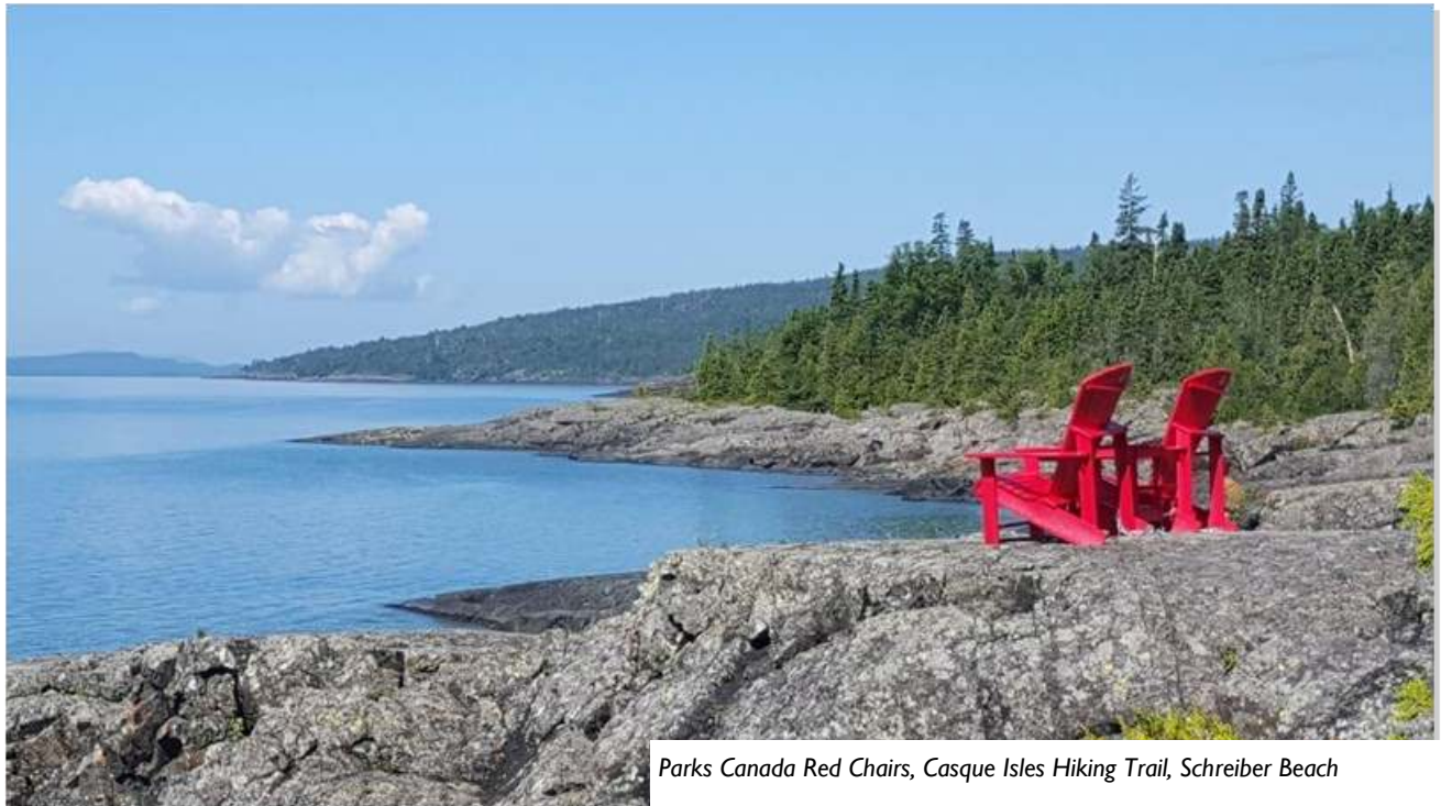
Parks Canada Red Chairs, Casque Isles Hiking Trail, Schreiber Beach

Your smile for the day