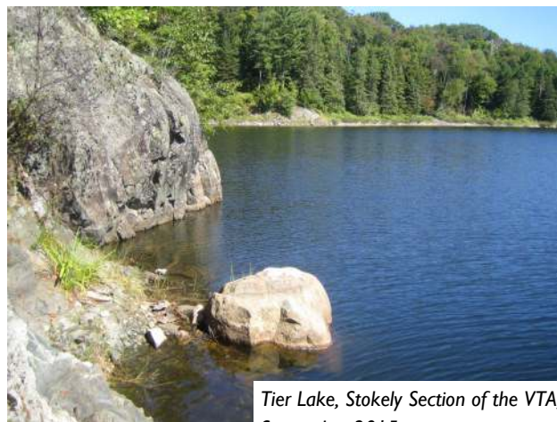
Tier Lake, Stokely Section of the VTA, September 2015