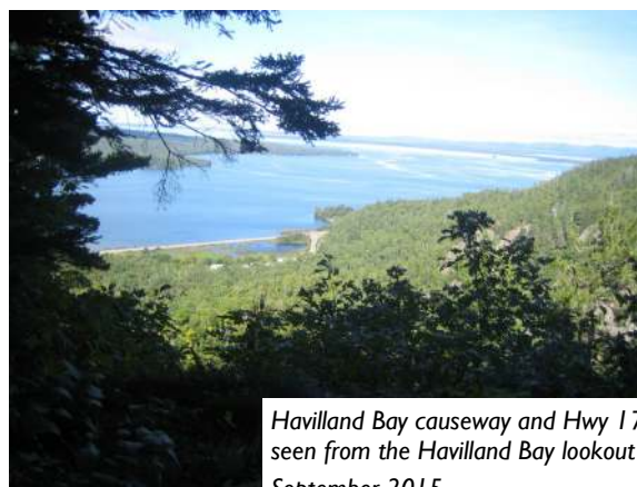
Havilland Bay causeway and Hwy 17 seen from the Havilland Bay lookout September 2015