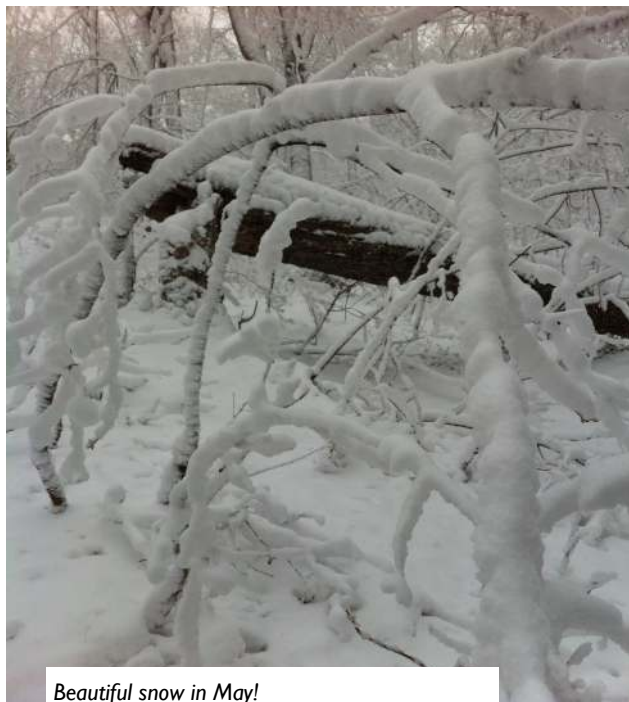
Beautiful snow in May!