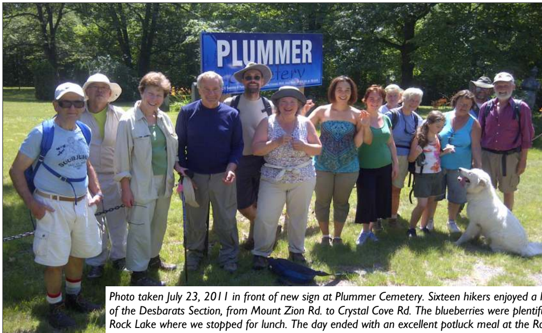
Photo taken July 23, 2011 in front of new sign at Plummer Cemetery. Sixteen hikers enjoyed a lovely walk along part of the Desbarats Section, from Mount Zion Rd. to Crystal Cove Rd. The blueberries were plentiful at the lookout over Rock Lake where we stopped for lunch. The day ended with an excellent potluck meal at the Ropke's, where some went for a dip in the Thessalon River. Thanks to Dieter and Erika for continuing this wonderful tradition.