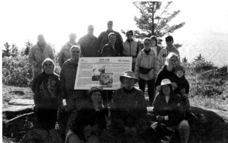
Thanks to Kelsey Johansen for these amazing photos of the Gros Cap Loop Hike following the 2010 VTA Annual Meeting! As can be seen from the photos, it was a beautiful fall day filled with spectacular views and great company!!

The meeting wrapped up and everyone headed to the Gros Cap Loop Trail so we could enjoy the glorious fall weather! Thanks to all who attended.