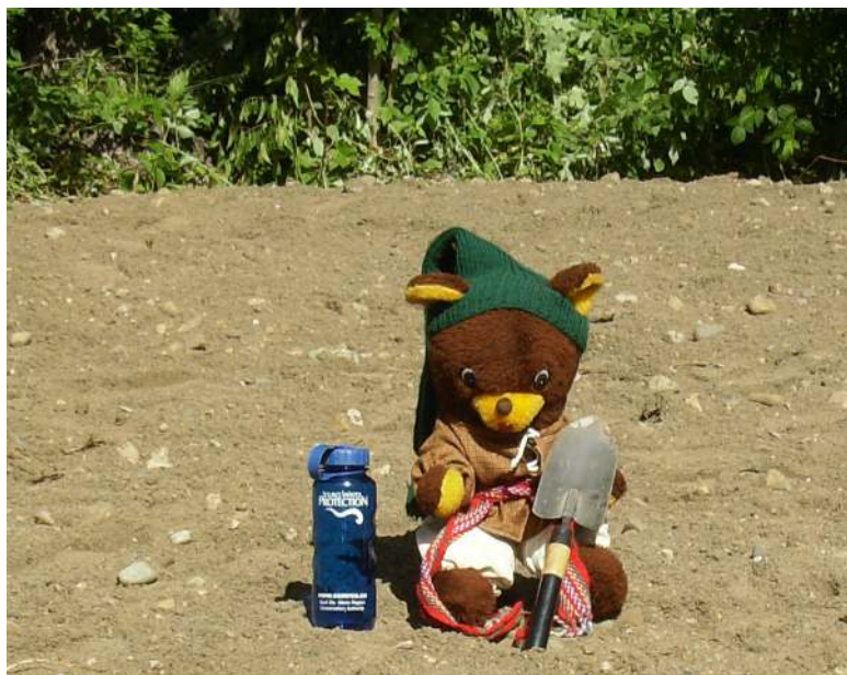
Pierre the Bear has a rest after an intense day of parking lot building.