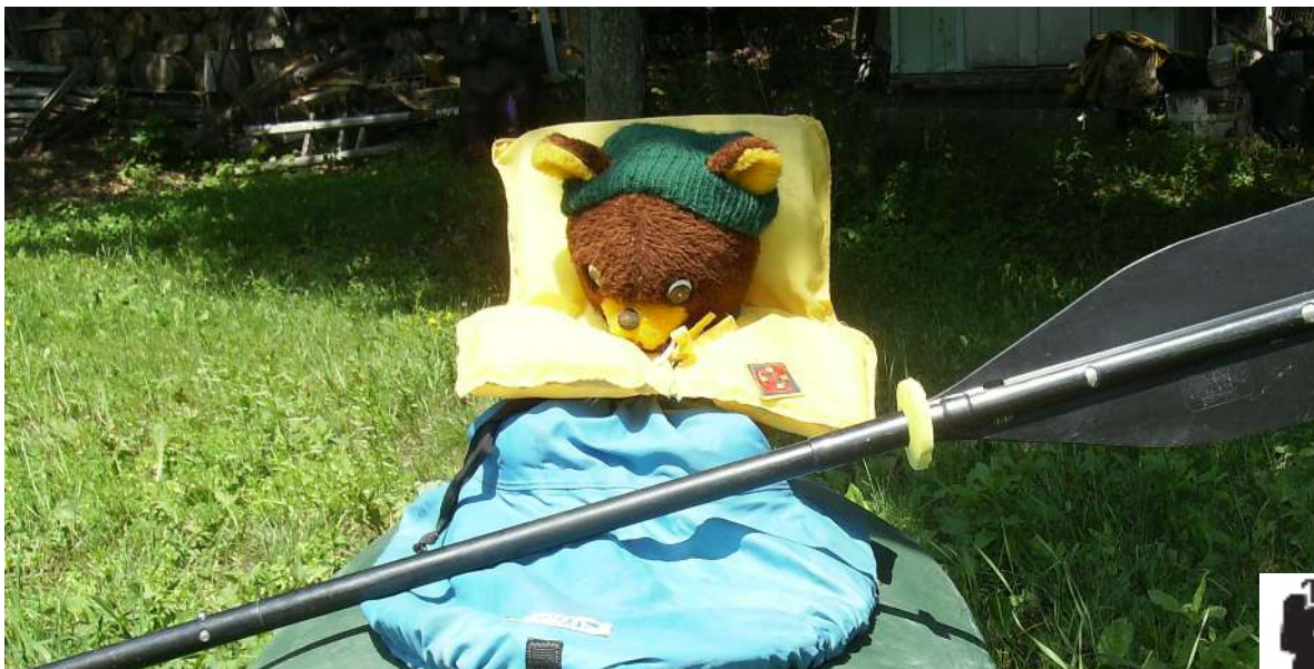
Pierre the Bear gets ready for a safe paddling adventure!