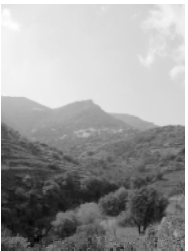
Terracing on hiking terrain

In times past, Tinos supported 30,000 people. Today there are only 8,500 people. The extensive terracing allowed grazing, fruit tree culture and vegetables. People lived off the land. We encountered many structures indicating such farming. Some had a flat plateau (circa 7 m diameter) attached which had upright slabs at their perimeter and a flat floor formed by very large slabs. Today these plateaus make one think of religious rituals but this is where people used to thresh, winnow grain, store hay etc.