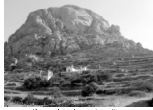
Dovecoats and mountain, Tinos

On Andhros we stayed at Hora and hiked on steep, stony and ancient paths. The stonewalls terracing most of Greece were magnificent here. The horizontal walls were frequently