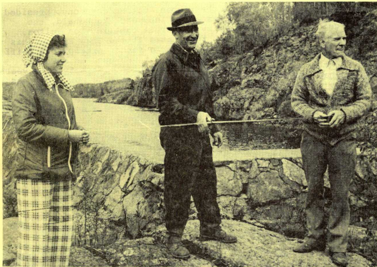
THE OPENING OF THE THESSALON SECTION 1978 10 01