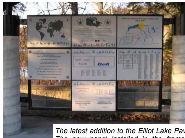
The latest addition to the Elliot Lake Pavilion. The new panel installed in the frame, the quarter panel in the upper right quadrant.

these smaller panels are full. Then a new quarter panel is started and so on, these smaller panels take far less waiting time than a full panel, this enables the names and dedications of the donors will be on display at the pavilion in a more timely fashion.