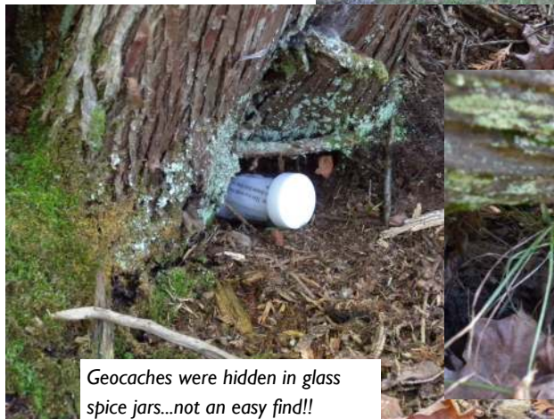
Geocaches were hidden in glass spice jars...not an easy find!!