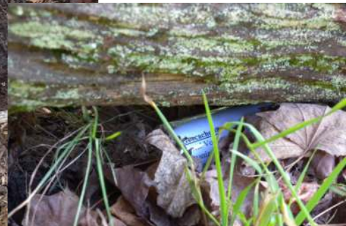
And some were even harder to find...