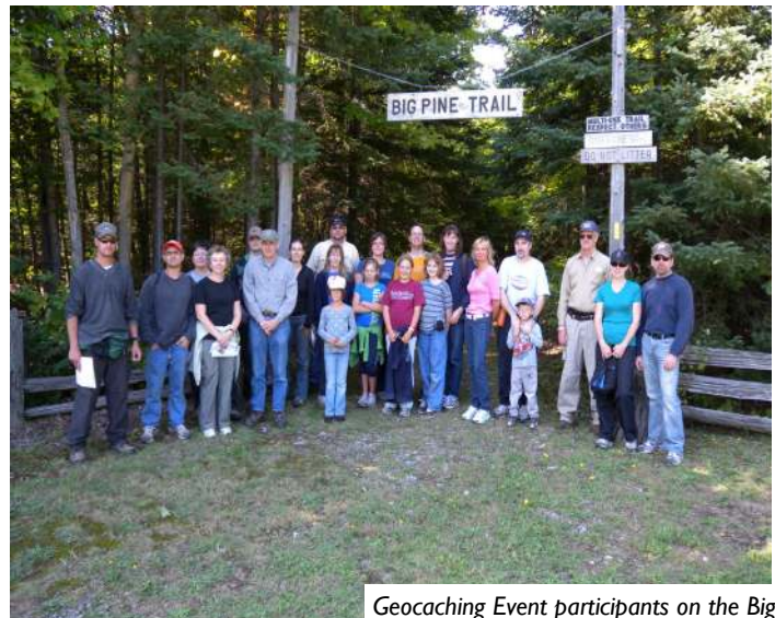
Geocaching Event participants on the Big Pine Trail at Glenview Cottages

typical walk in the woods for some northern Ontario trail users. Interested readers are encouraged to visit www.geocaching.com to learn more about this fast-growing outdoor activity. (con't on page 2)