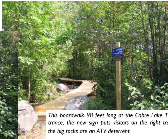
This boardwalk 98 feet long at the Cobre Lake Trail entrance, the new sign puts visitors on the right trail, and the big rocks are an ATV deterrent.